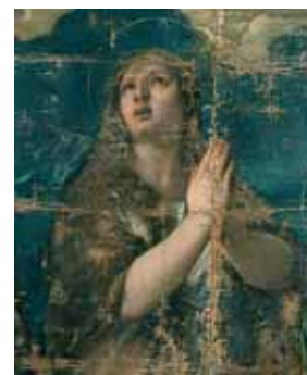
Detalj nakon čišćenja i uklanjanja starih retuša ~ Detail after the cleaning and the removal of altered retouches