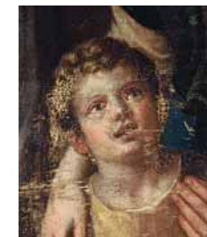
Detalj tijekom čišćenja i uklanjanja starih retuša ~ Detail during the cleaning and the removal of altered retouches