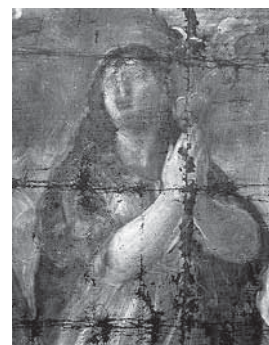
RTG snimak istog detalja ~ X-ray of the same detail