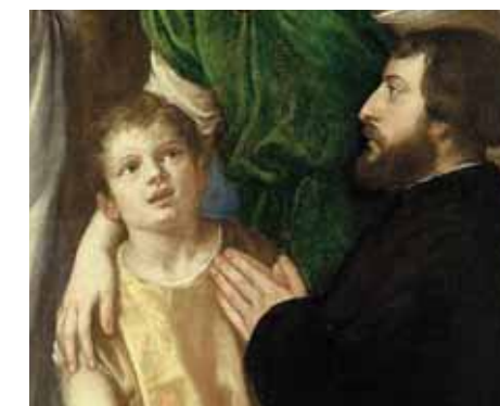
Detalj nakon restauratorskih radova ~ Detail after conservation

The recently concluded conservation works have considerably enhanced the legibility of the painter's brushstroke and the chromatic relations, allowing better comprehension of the visual and stylistic features. Backed up with scientific research and an insight into the painting technique, they have enabled a more detailed comparison to be made with the master's manner of work, particularly with solidly dated works of the end of the fifth and the beginning of the sixth decade of the 16 th century. The characteristic treatment of colours, particularly in the details, and the dazzling colouring of the plastically emphasised figures