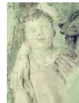
UVF snimak istog detalja ~ UVF of the same detail