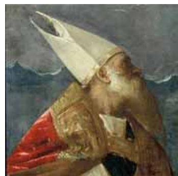
Detalji nakon restauratorskih radova ~ Details after conservation

Premda su znatna oštećenja slikanog sloja identificirana rendgenskim i infracrvenim snimkama, njihova se raznovrsnost pokazala tek tijekom radova: od velikih zona otpale boje uz rubove formata, horizontalnih traka nedostajuće i nagnječene boje od posljedica namatanja platna do tisuća sitnih oštećenja slikanog sloja koji je zbog oslabljenog veziva otpao s osnove. Stanje očuvanosti