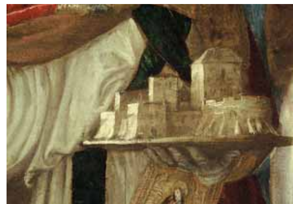
Detalj nakon restauratorskih radova ~ Detail after conservation

Retuš kao i drugi restauratorski postupci izvedeni na slici u tehničkom smislu nisu bili inovativni, već su dio potvrđene i provjerene restauratorske prakse, a osim nekih specifičnosti, najveća je pažnja posvećena preciznosti izvedbe uvjetovanoj karakterom oštećenja i važnošću ovog djela u hrvatskoj baštini. ¶